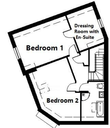
GOODYEAR HOUSE, FLAT B - FIRST FLOOR